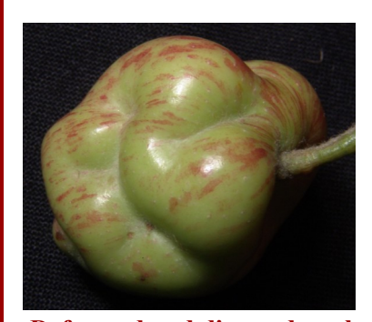
Deformed and diseased apples

Suitable for testing Apple chlorotic leaf spot virus, Apple stem grooving virus, Apple stem pitting virus, Apple mosaic virus and Apple scar skin viroid